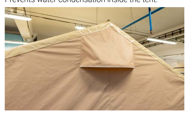
WINDOW FOR BETTER AIR CIRCULATION Prevents water condensation inside the tent. Don't need to be switched off = saves space.