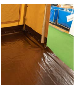
ATTACHMENT OF FLOOR TO BEDROOM WITH A D-RING

Velcro strap in bedroom corners. Perfect protection against water penetration.